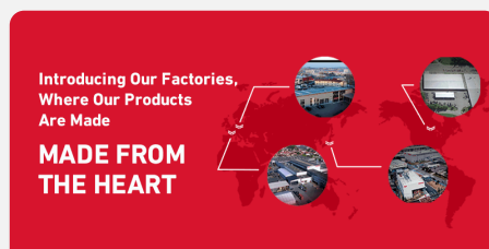
MADE FROM THE HEART