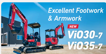
Excellent Footwork & Armwork